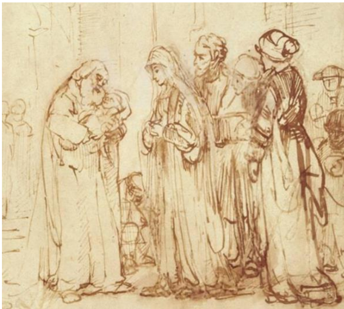
"Simeon and Jesus in the Temple" sketch by Rembrandt Harmenszoon van Rijn

1 st Sunday after Christmas, December 29 th , 2024 • 10:00 AM